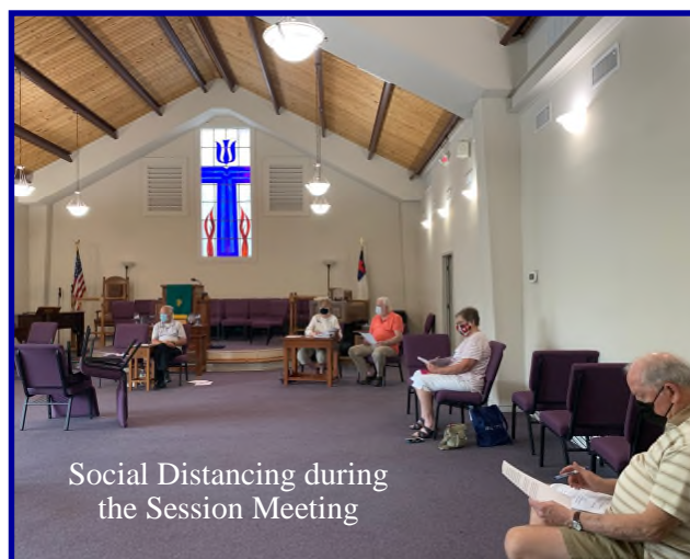
Social Distancing during the Session Meeting